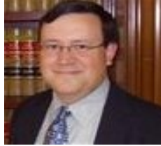
Jacob Lofgren Mayor Pro-Tem